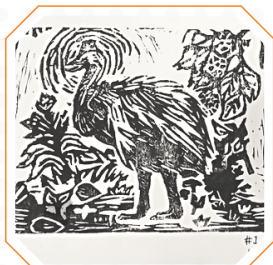
Art Credit: Cipta Hussein