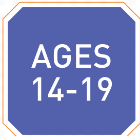
Art Credit: Hafsa Habib