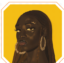
Art Credit: Ajaiyah Oladeinde